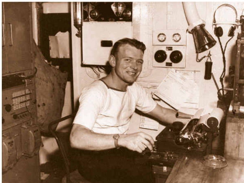
W/T office 1954

Tui's communications fit as a training ship was a TCS12, Collier and Beale 4125 transmitter and receiver, an 86M and a B28.