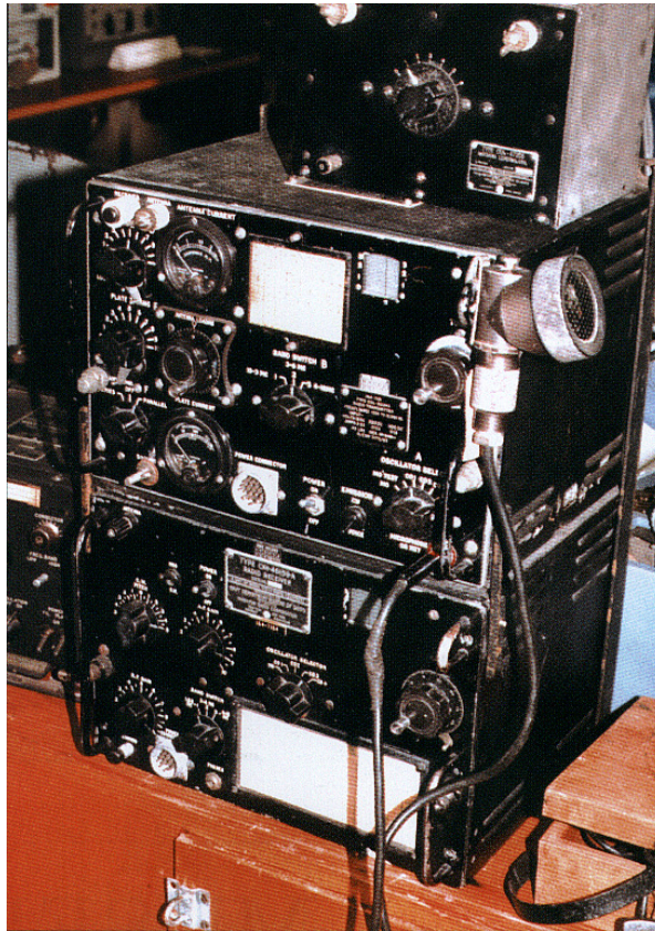
TCS12 – 1.6-12 MHz AM, CW

After conversion, the communications fit changed to an 89M and 691/CUH in the wheelhouse, with the 618 replacing the TCS12 and B40 replacing the B28 in the W/T office.