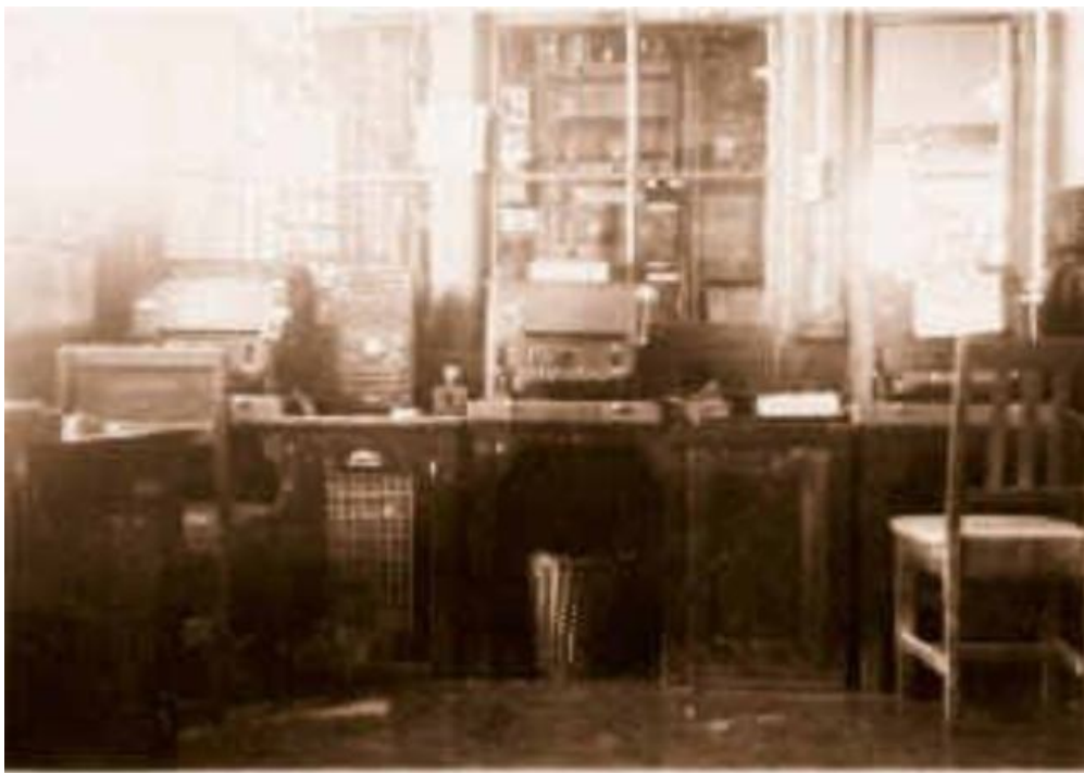
Landline Room 1948 – on the left is the circuit to/from NZPO, centre is the inward link from Navy Office in Wellington and on the right is the outward link to NO Wellington

1949 The volume of naval traffic which had decreased markedly following the end of the war began to increase and this, together with a significant increase in commercial marine activity saw a steep rise in traffic which the Morse circuits were finding it