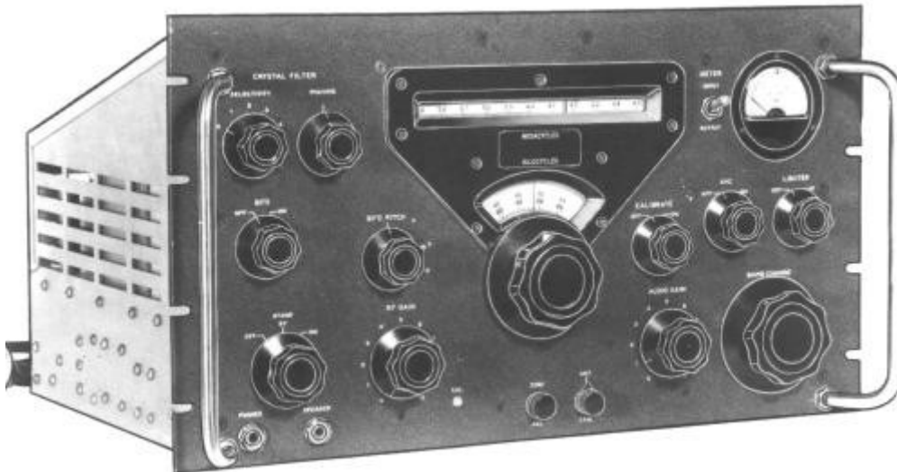
Collins 51J-4 Receiver – very similar in appearance to the Racal RA117

To ameliorate the transmitter problems an order was placed for two new British DS13 transmitters with a rated output of 40KW and provision for multi-channelling and full frequency-shift-keying.